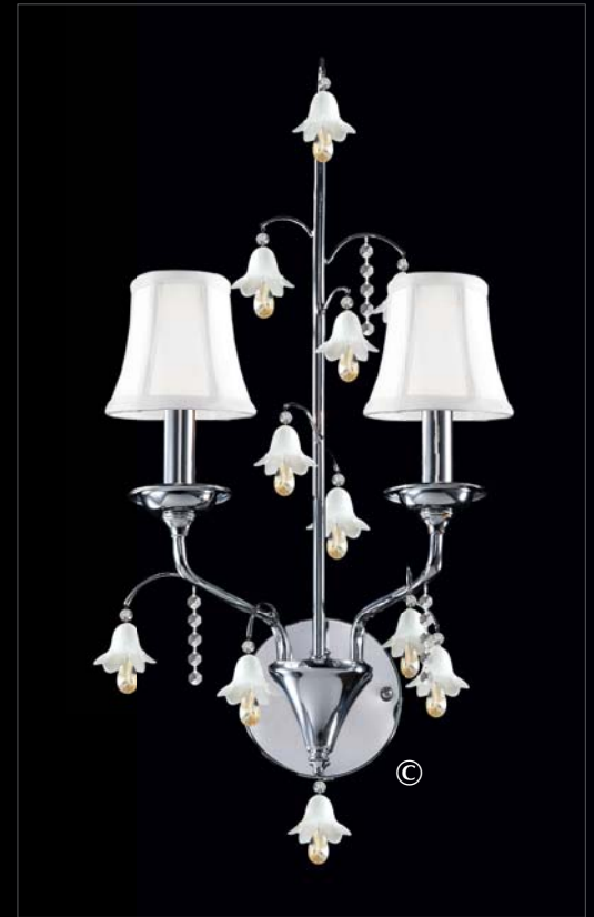
96321S2W-97 Crystal: MURANO™ (-22) (pictured), Ø3 x 60w, ↔13"(33cm) x ↓20"(51cm) 10"(25cm) Ext. Finish: Silver (S) or Aged Gold (AG).