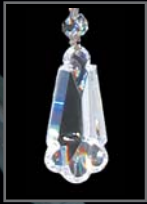
Flared Crystal Pendalogue