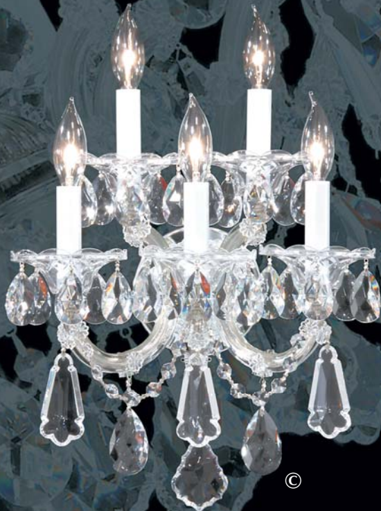
94705S22 (Wall Sconce) Crystal: IMPERIAL™ (-22) (pictured), Ø5 x 60w, ↔14"(36cm) x †19"(48cm) x 10"(25cm) Ext. Finish: Silver (S) or Gold Lustre (GL).