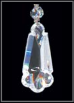
Flared Crystal Pendalogue