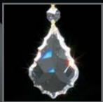
Shape of Crystal components for Swarovski ® crystals (-00) and SPECTRA ® CRYSTAL (-11) options.