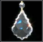
Shape of Crystal components for Swarovski® crystals (-00) and SPECTRA® CRYSTAL (-11) options.