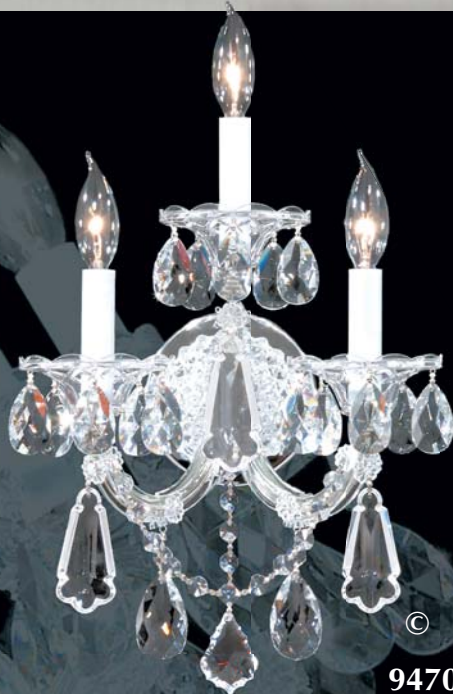
94703S22 (Wall Sconce) Crystal: IMPERIAL™ (-22) (pictured), Ø3 x 60w, ↔12"(30cm) x †19"(25cm) x 10"(25cm) Ext. Finish: Silver (S) or Gold Lustre (GL).