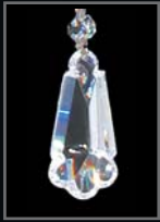
Flared Crystal Pendalogue