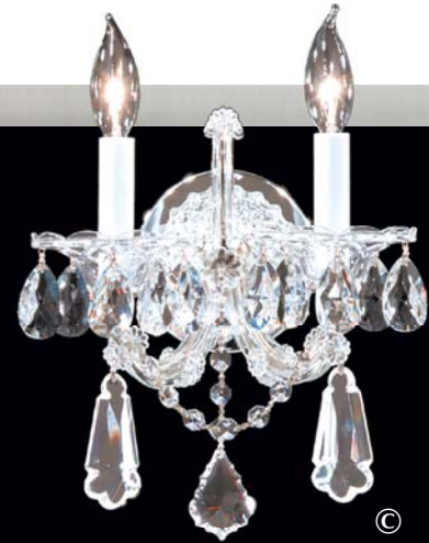
94702S22 (Wall Sconce) Crystal: IMPERIAL™ (-22) (pictured), Ø2 x 60w, ↔11"(28cm) x †14"(36cm) x 9"(23cm) Ext. Finish: Silver (S) or Gold Lustre (GL).