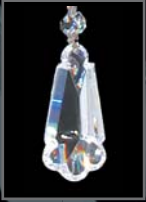
Flared Crystal Pendalogue