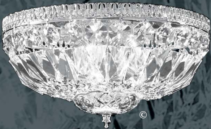
40652S22 Crystal: IMPERIAL™ (-22) (pictured), Ø3 x 40w, ↔12"(30cm) x ↓6"(15cm) Finish: Silver (S) or Royal Gold (G).