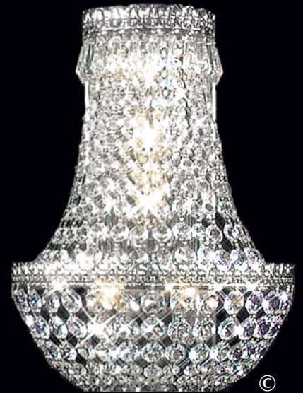
40531S22 (Wall Sconce) Crystal: IMPERIAL™ (-22) (pictured), Ø3 x 60w, ↔11"(28cm) x ↓15"(38cm) x 6"(15cm) Ext. Finish: Silver (S) or Royal Gold (G).