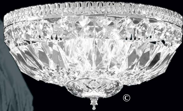
40651S22 Crystal: IMPERIAL™ (-22) (pictured), Ø3 x 40w, ↔9"(23cm) x ↓6"(15cm) Finish: Silver (S) or Royal Gold (G).