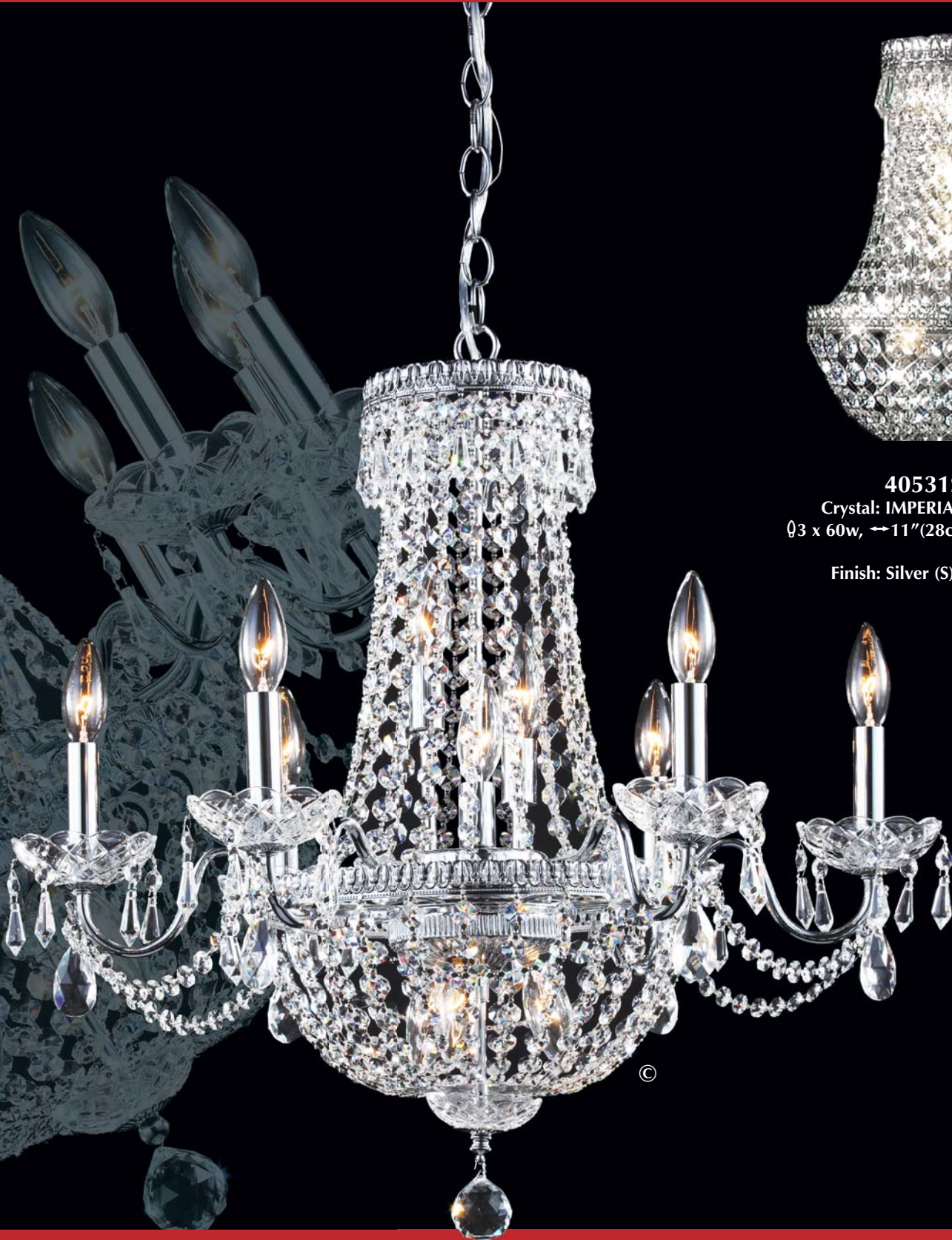
40660S22 Crystal: IMPERIAL™ (-22) (pictured), Ø6+6 x 40w, ↔25"(64cm) x ↓28"(71cm) Finish: Silver (S).

(STRASS & ELEMENTS are now named Swarovski® crystals)