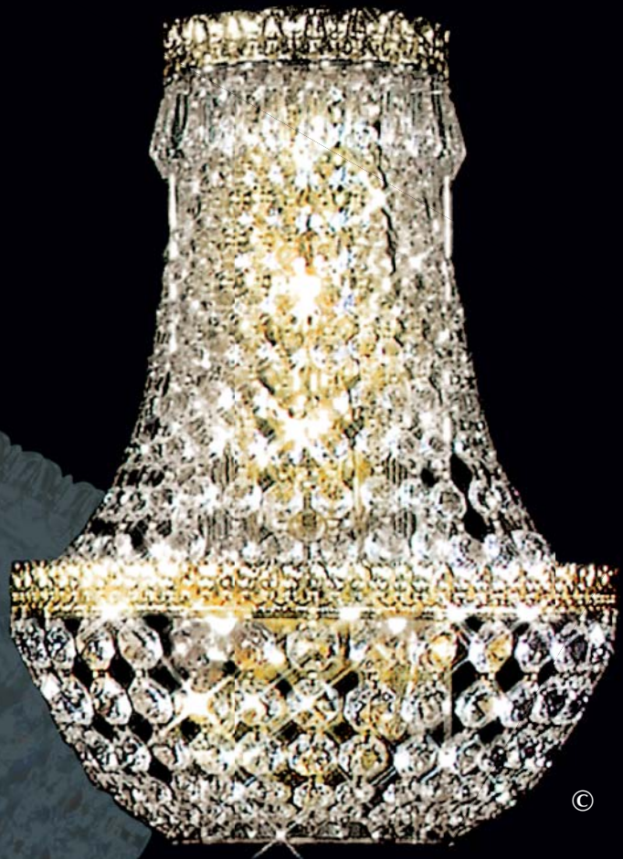
40531G22 (Wall Sconce) Crystal: IMPERIAL™ (-22) (pictured), Ø3 x 60w, ↔11"(28cm) x ↓15"(38cm) x 6"(15cm) Ext. Finish: Royal Gold (G) or Silver (S).

(STRASS & ELEMENTS are now named Swarovski® crystals)