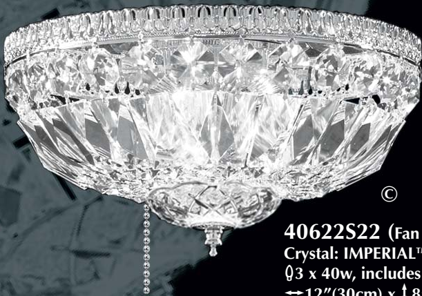
40622S22 (Fan Kit Version) Crystal: IMPERIAL™ (-22) (pictured), Ø3 x 40w, includes pull switch ↔12"(30cm) x ↓8"(20cm) Finish: Silver (S), Bronze (BZ) or White (W).