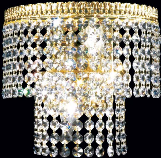
40534G22 (Wall Sconce) Crystal: IMPERIAL™ (-22) (pictured), Ø2 x 60w, ↔10"(25cm) x ↓9"(23cm) x 5"(13cm) Ext. Finish: Royal Gold (G) or Silver (S).