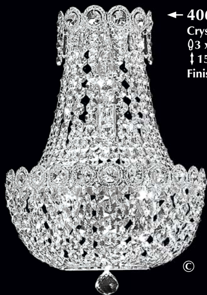
← 40634S22 (Wall Sconce) Crystal: IMPERIAL™ (-22) (pictured), Ø3 x 60w, ↔10"(25cm) x ↑15"(38cm) x 6"(15cm) Ext. Finish: Silver (S).

Sometimes, less is more. The light dainty trim embellished by fine cut Crystal – and the delicate, ornate embossed banding gallery – makes these IMPACT™ Crystal Chandeliers eye catching. They will be the center of attention in any room setting.